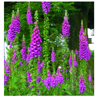
foxgloves