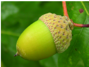
acorn - P. Precey