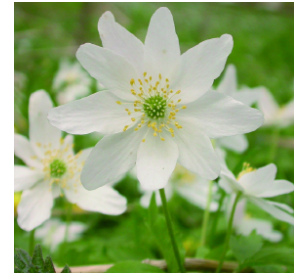
Native wood anemones indicate that a wood is very old